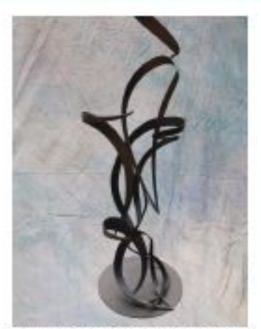
METAL DESIGN SCULPTURE: By Ken Schwartz