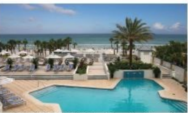
TWO NIGHT STAY: Hilton Oceanfront Resort, Includes Tour Package & Dinner for Two