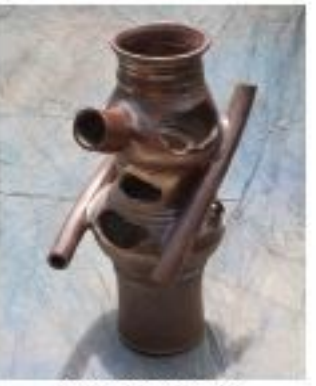
CERAMIC VASE: By Hergesheimer