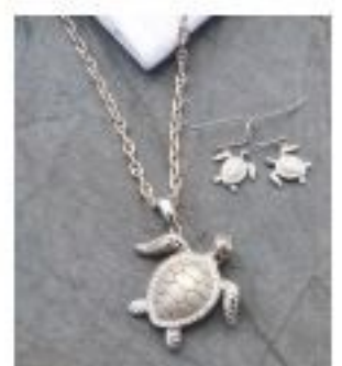
TURTLE LOVE: Sterling Silver Necklace & Drop Earrings