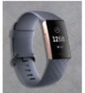
FITBIT CHARGE 3: Fitness tracker