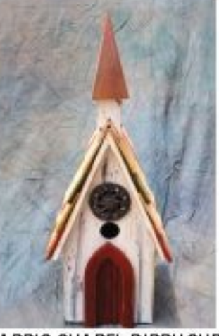
CLASSIC CHAPEL BIRDHOUSE: Includes Outdoor Pole

Suggested Donation: $2 per ticket. ORDER TICKETS TODAY! Make Check Payable to : FFGC 2021 Convention Mail to : FFGC 2021 Convention PO Box 560111 Rockledge, FL 32955 Laura Ennis, Chairman, laura.e.ennis@gmail.com; 321-543-7130