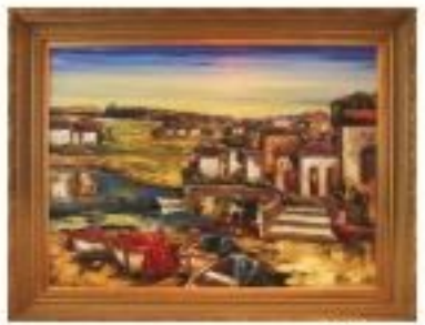
OIL PAINTING: Seaport Village, Size 4'x5', Solid Wood Frame